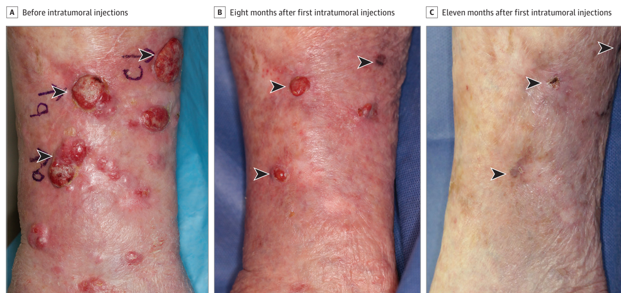
Figure 1. Complete Regression of Multiple Basaloid Squamous Cell Carcinoma Tumors After Combined Systemic and Intratumoral Delivery of the 9-Valent Human Papillomavirus Vaccine

Arrowheads indicate tumors that were directly injected with the vaccine. Complete tumor regression was observed 11 months after the first intratumoral dose of vaccine.